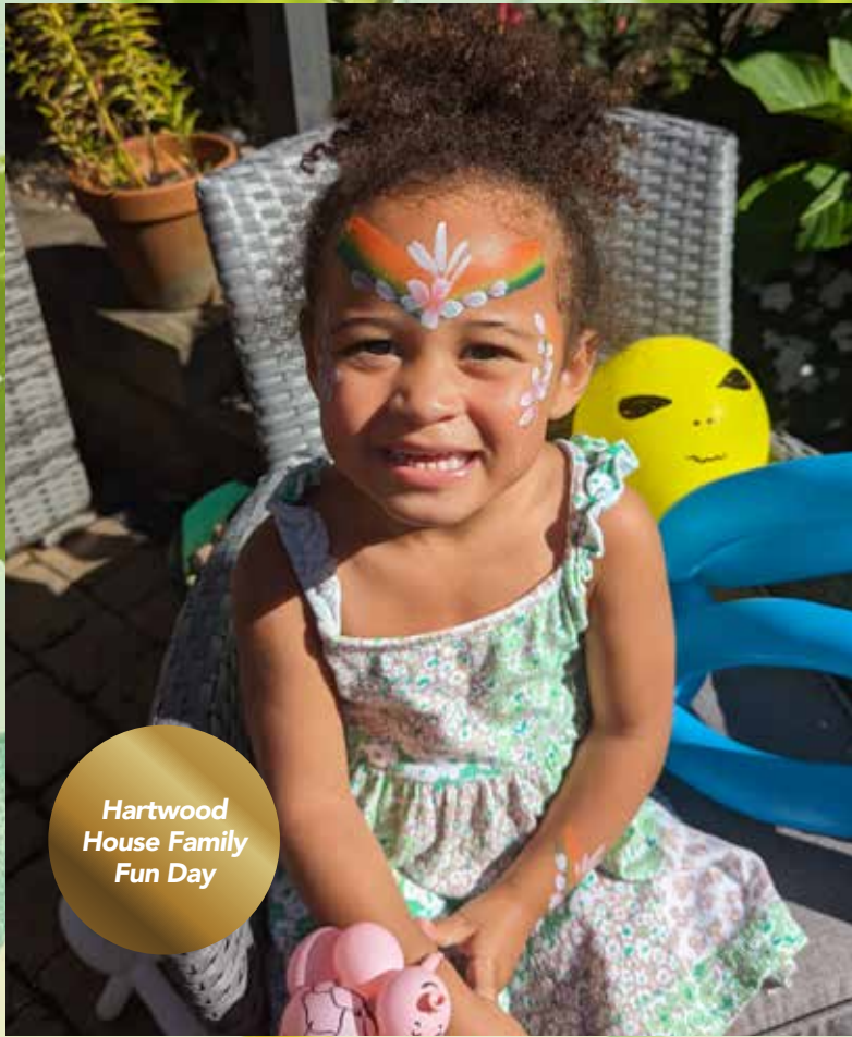
Hartwood House Family Fun Day