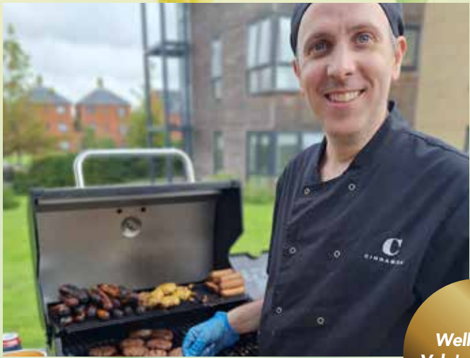
Wellington Vale's Summer Fête