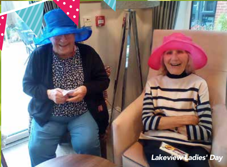
Lakeview Ladies' Day