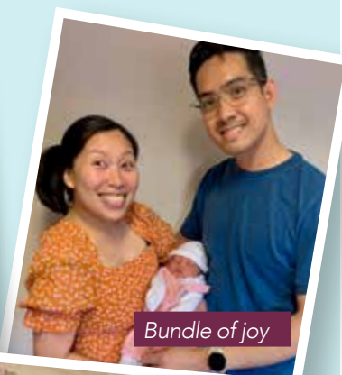
Bundle of joy