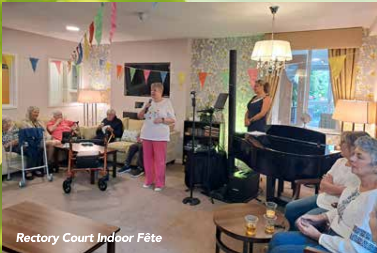
Rectory Court Indoor Fête