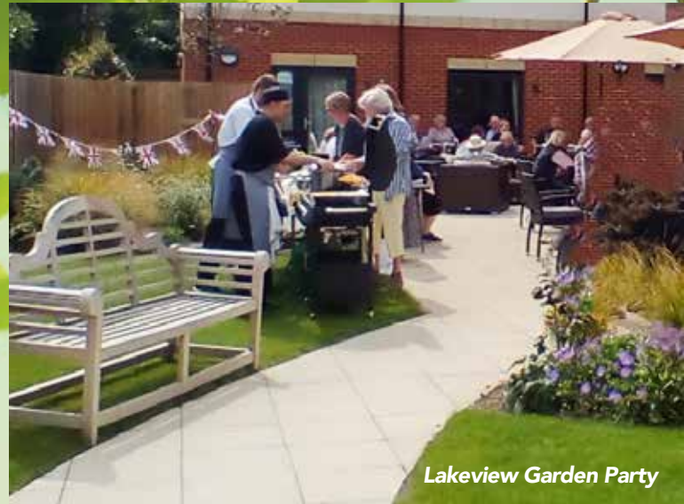
Lakeview Garden Party