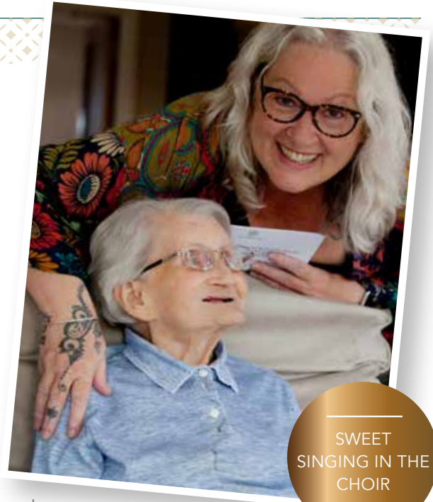
SWEET SINGING IN THE CHOIR

The Abbotswood team were delighted to be involved in the creation of the accompanying music